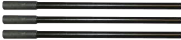
3 long metal tubes with joint connector